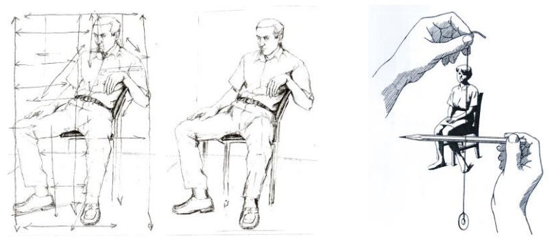
Figure 1. Examples of Triangulation Point.

While drawing a figure, in order to determine the proportions, geometric forming is necessary. Especially in drawings with living models, a kind of triangulation point and geometry is necessary in order to determine the changing dimensions due to optical image. Triangulation point will be an important tool in that it will help analyze the pattern to determine the rate of ideal figure and object patterns (Fig. 1). It is aimed that possible problems during application process are eliminated by determining the anatomical features for students who are currently studying Art and Crafts Teacher Education.