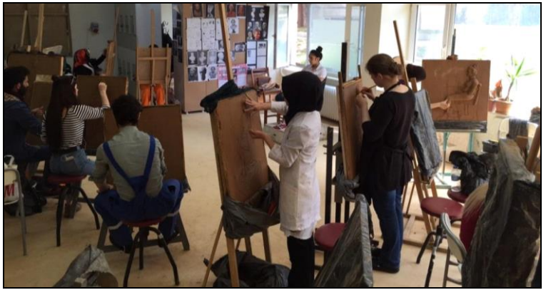
Sculpture\ Course-Living\ Model\ Relief\ Practice