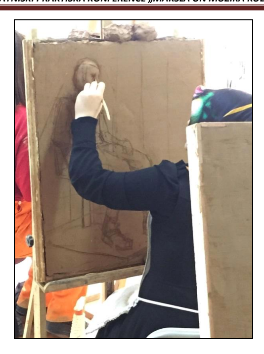
Living Model Relief Practice (details)