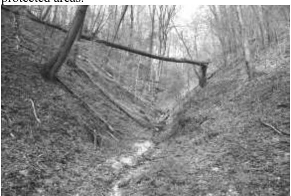
Fig. 2. Permanent gully Svarinsku grava within the nature monument "Adamovas krauja". Despite the comparatively low contribution to the geodiversity, such landforms have to be valued regarding biodiversity, e.g. due to the presence of protected habitats of EU of Habitats Directive like "9180 Tilio-Acerion forests of slopes, screes, and ravines".

be noted. In both nature areas gullies are widely distributed and deeply dissect the slopes of larger landforms, creating dense erosion network of temporal watercourses. Although the topographical irregularity determined by linear erosion network, in general, is an important contributing factor to the geodiversity in both areas; nevertheless, gullies itself as landforms within areas under study do not correspond to the status of objects of geoconservation significance. Their importance, in this case, should be noted in another context, i.e. gullies underpin the development of protected habitats of EU importance (Fig. 2) and hence contribute to the biodiversity of protected areas.