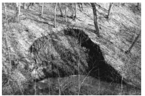
Fig. 3. Landslide development on the left slope of the river Dubupīte Valley, nature reserve "Pilskalnes Siguldiņa", as a typical example of morphogenetic processes contributing to the geodiversity.