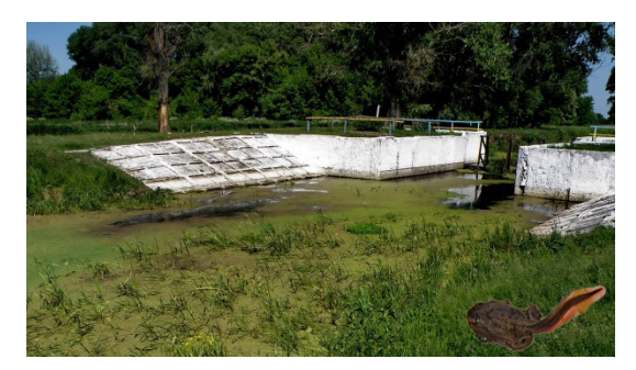
Fig. 3. Amelioration channel - breeding habitat for B. bombina (River Trubizh, Kyiv region, Ukraine: biotope and juv. B. bombina ).