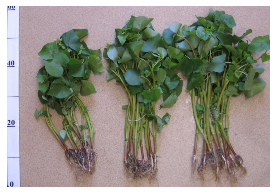
Fig.1. Effect of lignin product on the development of plants of common buckwheat Fagopyrum esculentum Moench, variety 'Aiva' in 28 days after the sowing – bud phase. From the left to the right, plants from the variants: control, L - 40 \text{ kg ha}^{-1} , LSi - 40 \text{ kg ha}^{-1} . 10 plants are represented in each variant.