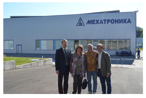
Fig.1. Company "Mechatronica" building

At the Technical University of Gabrovo, (Gabrovo is a town which had the greatest number of industrial enterprises in Bulgaria until the year 2000) we are continuing to look for a formula meeting in the most complete way the growing need of society for generating more and more not only knowledgeable, but also capable young people. In this regard, the relationship between universities and business is of particular importance. In Gabrovo, there are currently only a few industrial enterprises, but some of them, such as the Bulgarian-Swiss company "Mechatronica" (Fig.1), the German-Bulgarian company "AMK", the Austrian-Bulgarian company "Instrument" and some others, perform at a modern European level.