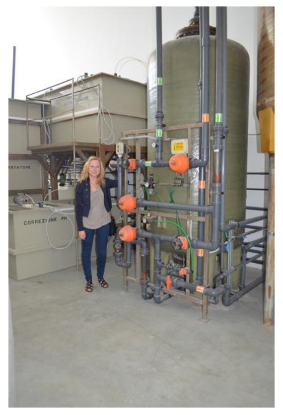
Fig.12: Part of an advanced system for wastewater treatment (after the process of electroplating)

The aim is to create an opportunity for practical training of knowledge and skills at the Training Centre, which will gradually grow into a utility production area.