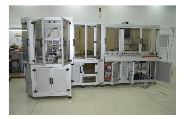
Fig. 3: A module of high-tech manufacturing