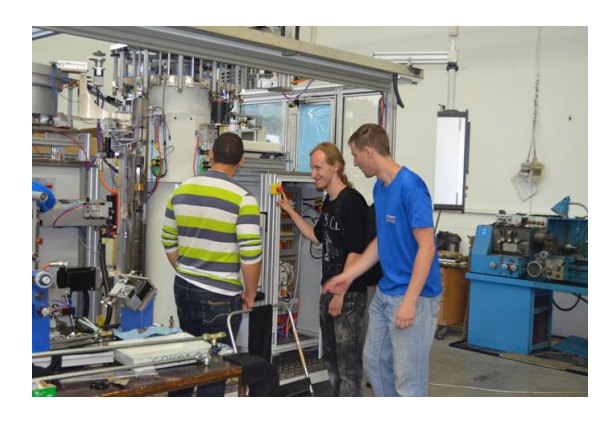
Fig. 5: Soldering of electronic components on a printed circuit boar In creation of a training center, the students who were on training at "Erasmus" program in the same company helped a lot. (Fig.6).

The main objective of this Center is the development of the relationship between theory and practice in order to ensure production with promising personnel among both high school graduates (Figure 4) and university graduates (Figure 5).