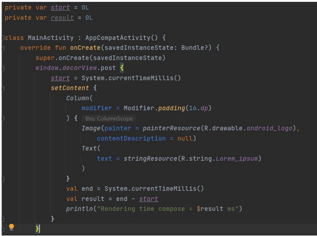
Fig.5. Source code of application with Kotlin+Jetpack Compose