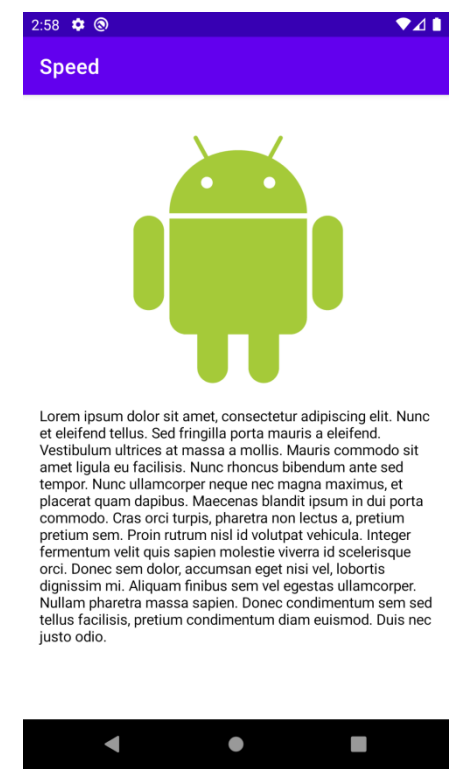
Fig.3. Application with Jetpack Compose

The source code of both applications is provided in Fig.4 and Fig. 5, the variables start and end record execution time to measure UI content preparation. Firstly, we save current time in start variable, after that we place corresponding layout code, and immediately after that we save current time in end variable. Now we can calculate the performance of each approach subtracting the end time from start time.