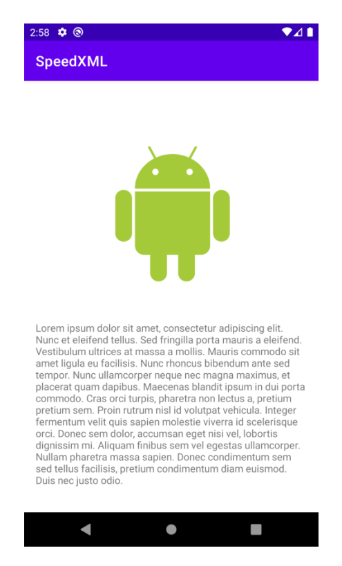
Fig.2. Test application with Kotlin+XML

Two Android applications with similar user interface were developed for the experiment. The version with Kotlin+XML is depicted inFig.2, but the version based on application of Kotlin+Jetpack Compose is depicted in Fig.3. User interface contains an image of Android OS logo followed by a Lorem Ipsum paragraph. Style of text may vary, but it does not impact on the experiment.