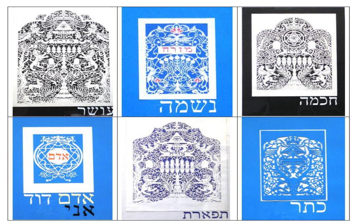
Fig. 3. Papercuts – example of Jewish art

The town is renowned for its modern cultural and religious events: Jorcajt and the Festival of Ciulim and Cholent, which are enjoying increasing popularity of residents, visitors and tourists. The Festival of Ciulim and Cholent has been held in different locations: in the years 2003-2005 at 31 Szczekocińska Street (50 41'0.826"N, 19 37'48.282"E); in the years 2006-2013 at 41 Szczekocińska Street (50 41'0.648"N, 19 38'2.445"E); and in the years 2014-2016 at 1 Sportowa Street (50 41'24.8"N, 19 37'17.177"E).