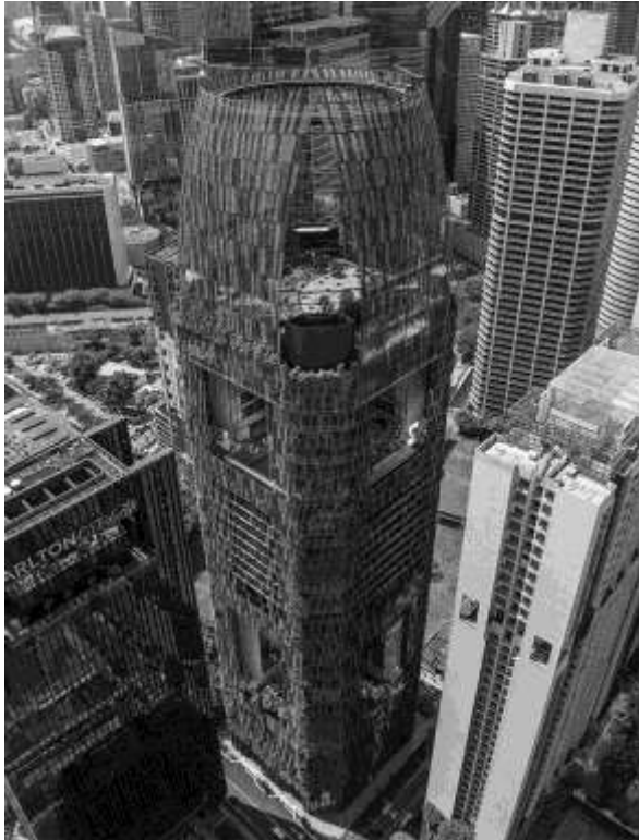
Fig.2. «Oasia Downtown», Singapore, WOHA Architects.