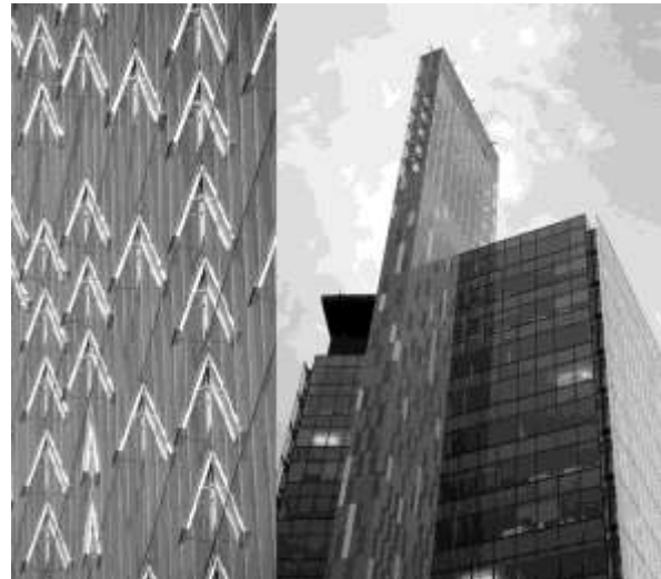
Fig.5. «Manitoba Hydro Place», Canada, Winnipeg, Kuwabara Payne McKenna Blumberg Architects.

The key innovative solution is a double envelope of the building. The inner layer with single glazing is separated from the glazed unit of the outer layer by a buffer zone of one meter width. In winter, when the façade is sealed, it acts as a solar collector. Without using active heating the temperature in the space between the facades reaches +20^{\circ}\text{C} even if the temperature outdoors is below -25^{\circ}\text{C} . "Solar ventilation" is used for effective air circulation in the system of natural ventilation of the building. Solar chimney is introduced in the building. It represents a shaft of 115 m height (Fig.5). The exhaust air is removed from the building through this "solar vent" through solar radiation heating. Heating and cooling system is based on using the geothermal heat of the earth. Three atrium recreation zones of 24m height are constructed in the building. They are a part of the natural ventilation system. The atriums have artificial "waterfalls" that regulate the humidity indoors. A systemic design approach to this object makes it possible to minimize and even abandon the use of air conditioning systems and save 70% of energy in comparison with a typical large office tower [16, 17].