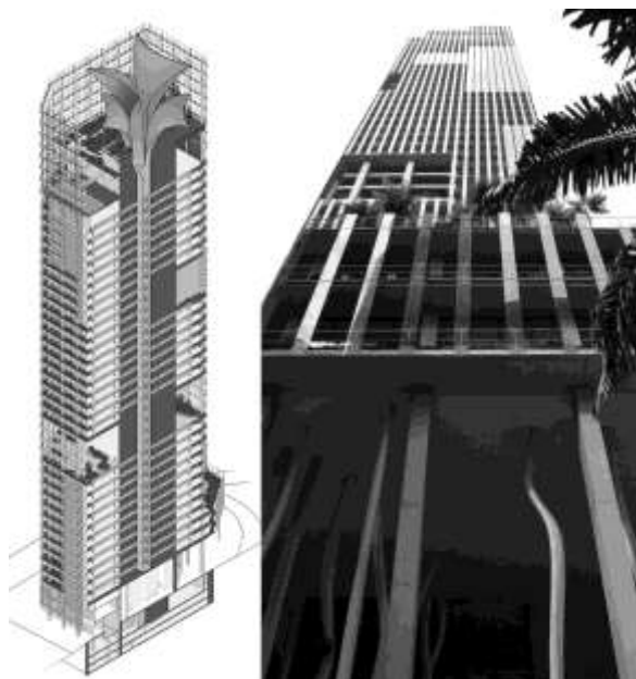
Fig. 1. «CapitaGreen», Singapore, Toyo Ito & Associates [13].

Equatorial climate is characterized by very little temperature and humidity changes throughout the year. Average annual temperature ranges from +25° C to +31° C. So it is always wet and hot, annual rainfall is about 2300 mm. The concept of “a tropical skyscraper” in Singapore was created in such climatic conditions. The efforts of architects and engineers were focused on searching for the ways of using natural ventilation, double skin facades for protecting buildings from overheating by vertical landscaping as well. Systems for collecting rainwater are introduced, etc.