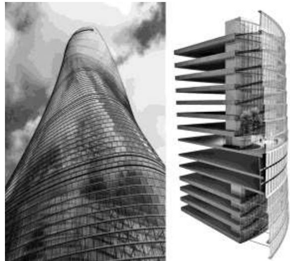
Fig.4. «Shanghai Tower», China, Shanghai, architect – Gensler

Nowadays China is the world leader in high-rise construction. China is located in different climatic zones from subequatorial to temperate. Shanghai, one of China's largest cities, has humid subtropical climate with monsoon features. The seasons are distinct -winter, spring, summer and autumn. The lowest temperature in winter is -10^{\circ}\text{C} . It often snows. The average temperature in summer is +32^{\circ}\text{C} . Annual rainfall is 1149 mm.