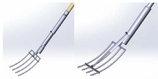
Fig. 3. Sketches of a mock-up sample of the manual self-cleaning fork (version 1).

In the course of the experimental design work, the author of the device modeled two versions of mock-up samples (Fig. 3 and Fig. 4).