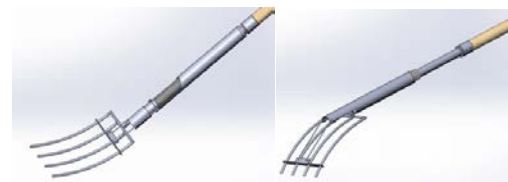
Fig. 4. Sketches of a mock-up sample of the manual self-cleaning fork (version 2).

Each of these versions differs in the direction of distribution of the user's force on the cleaning plate: above a plane of the tines (version 1) and below this plane (version 2). The results of the evaluation of the comparative effectiveness of the use of the design solutions will be presented based on the test results.