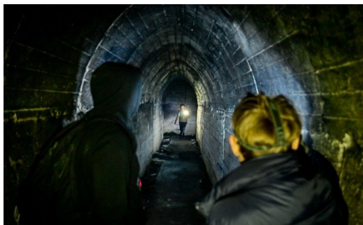
Fig. 1. Gallery in a uranium mine [bta]

The classic technology of mining uranium ore is at a loss. This is an expensive process, but due to the strategic production of the raw material, it is still supported in a number of mines [2], [9].