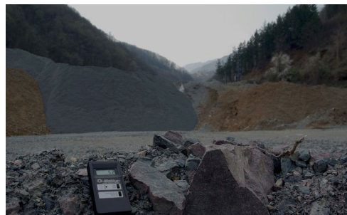
Fig. 2. Measurement of the radioactive background next to a mine in the Eastern Maris region

Currently, based on geological, ecological, economic, infrastructural and other considerations, 14 studied and partially exploited deposits of exogenous (sandstone) type from the Thracian-Tundzhan uranium ore region are of industrial interest. They are located in 3 geographical areas: Plovdivski, Haskovski and Yambolski and are localized in permeable rocks (sandstones), limited in section by marglite. As a result of the research and geological exploration works in the period 1970 - 1985, paleo-channel (Mominska, Marishka, Sokolishka, Tundzhanska) and paleolagun (Iztochnomarishka) structures were established in these areas (Fig. 2) [2]. Proved reserves and resources of these deposits are 10,384 t, of which 6,750 t are potentially recoverable. The industrial interest in them is determined by the proven possibility of applying the geotechnological method of extraction (drilling variant), one of the most progressive and ecological methods of extracting minerals in the world. Currently, 45% of the world's uranium mining is done by this method [15], [16].