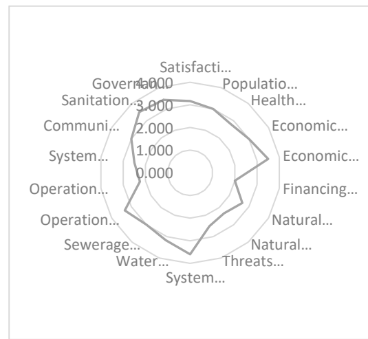
Fig 1. 1st IESSSR assessment in Palmira.

In the case of the two-stage evaluation carried out in Palmira, in the first stage an IGS of 3.010 was achieved, reaching the STABLE level, but with several factors at the UNSTABLE level and even two of them at the CRITICAL level. The averages of values by factors allow us to elaborate the following radial graph, shown in Fig. 1.