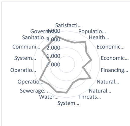
Fig 3. 1st IESSSR evaluation in Dos de Mayo.

In a second evaluation, carried out 7 months later, the values obtained were slightly higher, since an IGS of 3.233 was achieved, reaching the STABLE level, but with several factors in the UNSTABLE level, and even two of them in the CRITICAL level; and whose averages of values by factors allow to elaborate the following radial graph, shown in fig. 4.