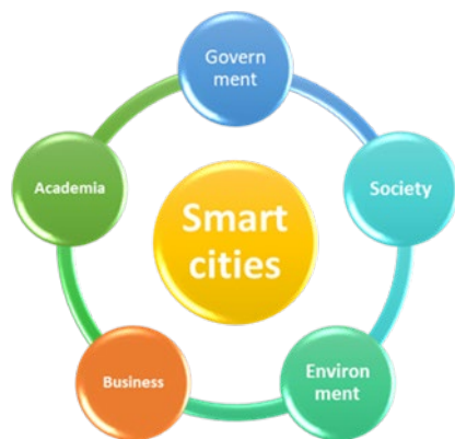
Fig. 2. Quintuple helix model, applied to smart cities.

By complementing traditional education with e-learning, the use of learning management systems and e-learning platforms have become the standard for educational institutions, especially in higher education [17]. Although the pandemic situation is now a part of our past, improved e-learning practices in the learning process are undergoing further development and e-learning has entered its next, more mature stage [18]. The introduction of artificial intelligence (AI), augmented reality (AR) and virtual reality (VR) in education will become compulsory in the near future. Smart learning is related to the use of modern technologies for teaching and evaluating the