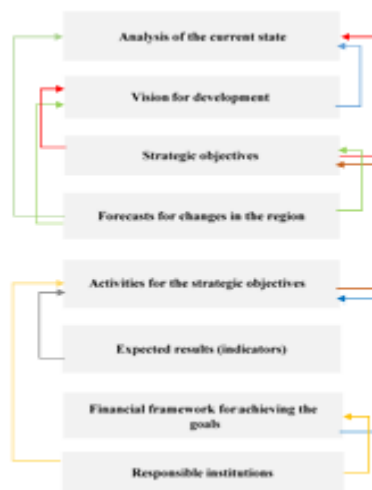
Fig. 1. Relations between document components.

Relationships between the components (structural elements of the document) subject to analysis are shown in Figure 1.