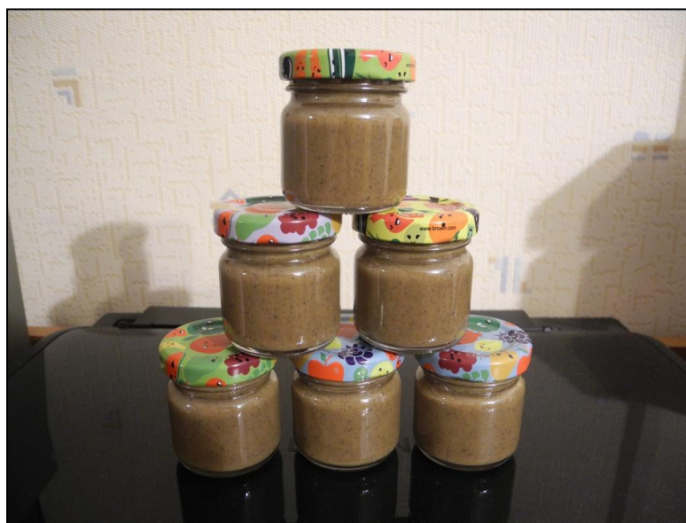
Fig. 3. Sweetened condensed milk with acorn coffee (prototype).