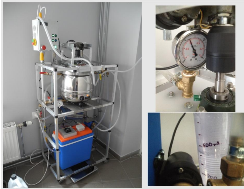
Fig. 1. Small volume vacuum evaporator-crystallizer prototype (authors own designed and made).

The next sequence of operations consists of pre-preparation of 2 main components – sweetened condensed milk and acorn coffee extract. For sweetened condensed milk production, it is necessary to calculate the correct amount of needed ingredients. As mentioned previously, technology of sweetened condensed milk with chicory is taken as a basis because it is most suitable for such coffee substitute variation production (Ozola, 1988; Stern et al., 1971; Kazansky et al., 1955).