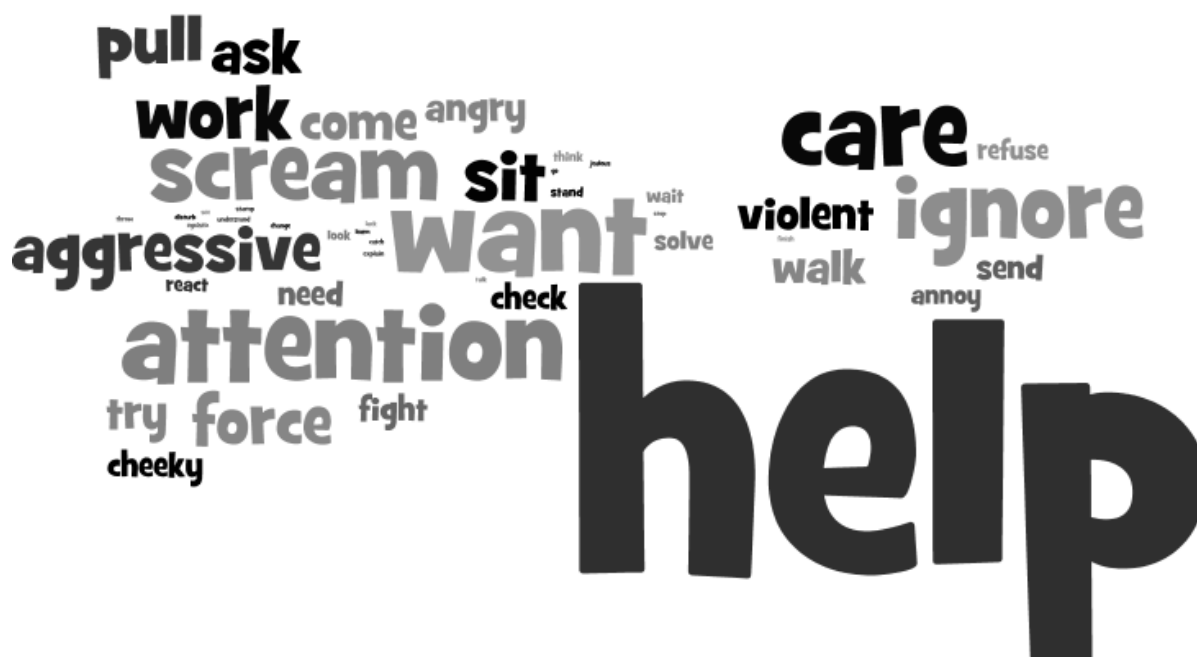
Fig. 2. Frequency of words used by junior student teachers

Junior student teachers focused on the child's need for help as a critical moment in the scene. The other frequently used words described that the teacher did not care or ignored the child, but the child still wanted teacher's attention . The most frequent adjectives used to describe the scene were aggressive , violent , cheeky and angry , describing the child's behaviour (Figure 2).