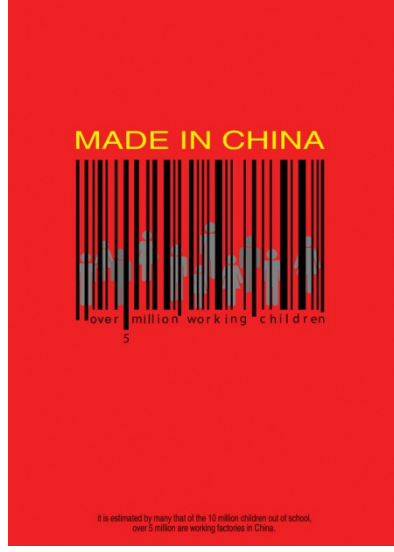
a) The First Poster

Below is the pictures of the posters which are showed to prospective teachers. In this research, prospective teachers were asked to explain their views about presented posters and their statements were digitized we reached to frequencies in Table 1, 2, 3, 4.