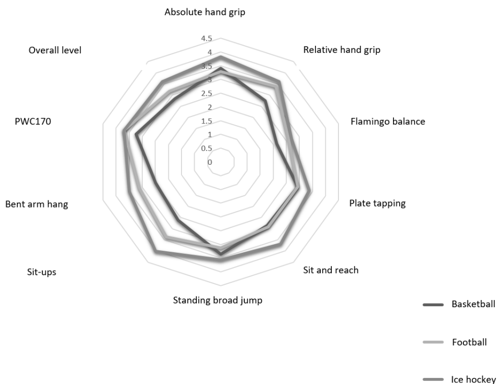
Figure 2 EUROFIT results in age group 14-15 years, n=300

As we can see in Figure 2, ice hockey players dominates in this age group also, but profile of basketball players gets wider and they got more of conditioning in every side. In this age group we also observe low results for all players in balance test (basketball 2.13, football 2.6 and ice hockey 2.9 level points), and for ice hockey test results even decrease in this age group. We can explain this with continuous puberty, which can affect balance and agility as well.