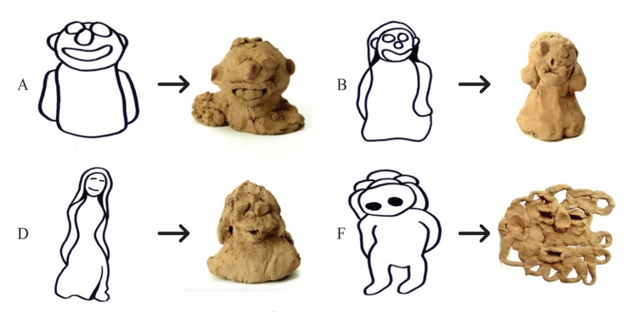
Figure 1 Self-Portrait Chewing Raisins

reflected in the interpretations "I am Climbing up a Rope" and "I am Crawling on a Bulk" (Figure 2).