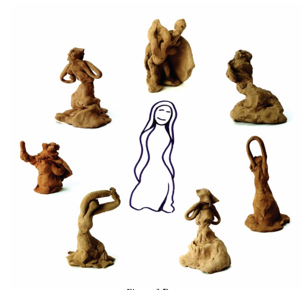
Figure 3 Dance

In some work the dance was related to a particular holiday, nice clothing and blowing long hair. The detailed but static scheme of a person was replaced with a dynamic figure of a girl. The most attention was paid to the arms. Not only the position in the space was changed but also the palms of the hands and fingers were pictured.