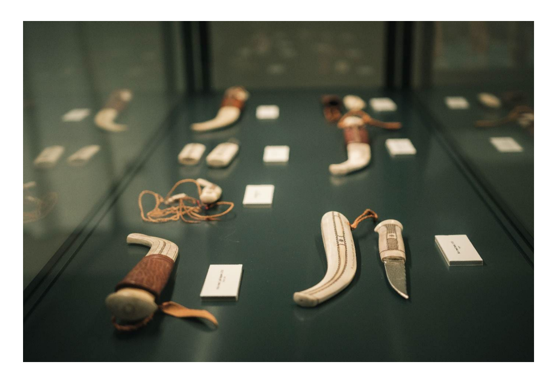
Figure 3 Per Isak Juuso. Sámi Center for Contemporary Art, Karasjok. The knife in the front of the photo has a smiley on it

The specific aspect of the exhibition by Per Isak Juuso was that the artist works with duodji, and presents an innovative and experimental take on this traditional Sámi medium (see Figure 1 and 2). The objects in the exhibition varied in size and were placed in the display cases in the foyer of the Sámi Center for Contemporary Art. Some of the objects were very small, measuring only 7 square centimeters, while others were 50 x 70 cm or larger. The challenge was to shape the entry point into the exhibition in an explorative approach, by encouraging visitors to look for details and the traces of the artist's innovative play with traditional media. For example, on a duodji knife, Juuso incorporated a smiley (see Figure 3) or in another piece he used plastic to create blue fringes (see Figure 4). Such details were very important. It was crucial to develop materials that would encourage children and young people to look closely, whether at a larger or a tiny artwork.