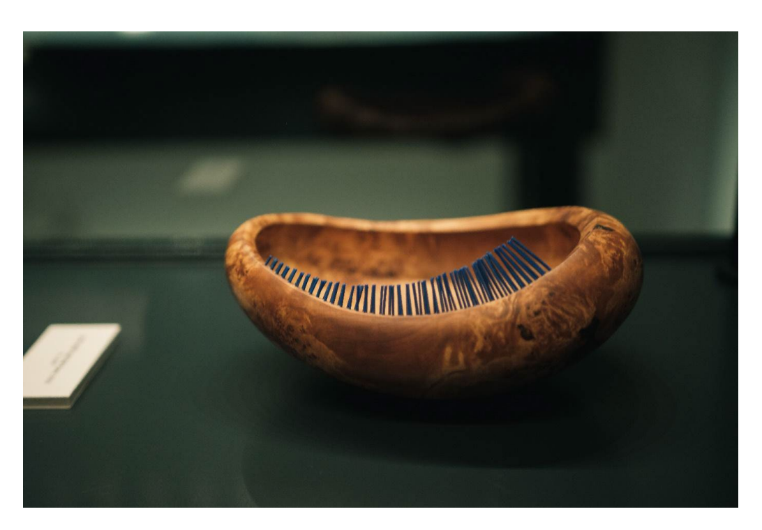
Figure 4 Per Isak Juuso. Sámi Center for Contemporary Art, Karasjok. The object contains plastic fringes

artistic object and the titles given to them by the artist. For example, in the sculpture titled "self-portrait," made from wood, iron, and the face made from moose horns, the children were asked to interpret why the sculpture is a self-portrait.