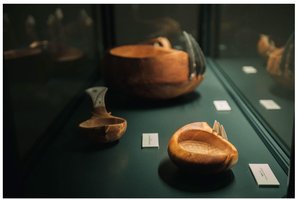
Figure 1, 2 Per Isak Juuso. Sámi Center for Contemporary Art, Karasjok